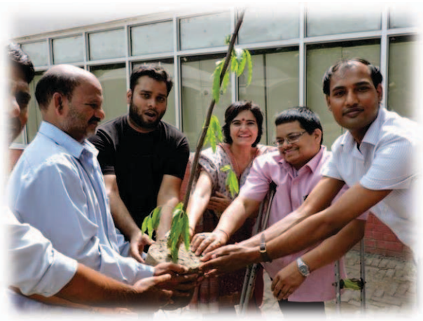
Plantation drive on World Environment Day