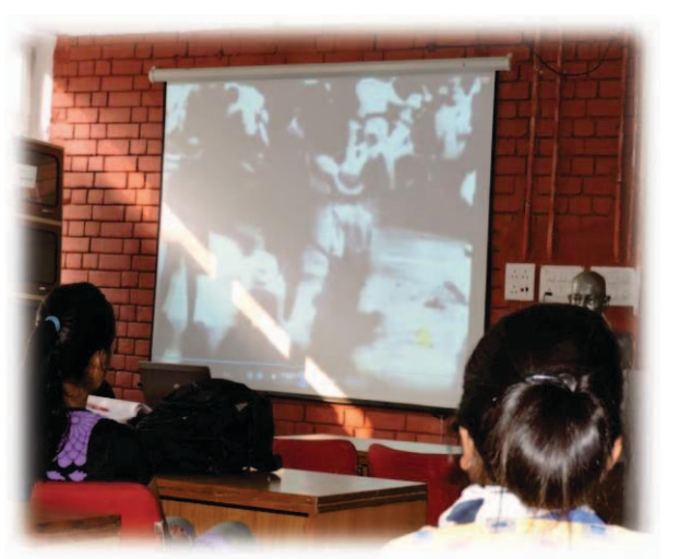
Screening of film in progress