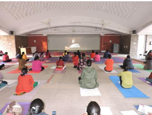
Screening of documentary 'Mahatma'