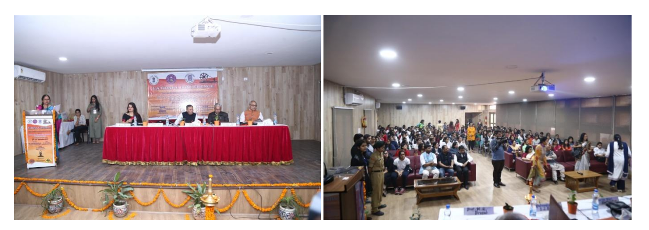
National Conference on 'Holistic Yoga: H3 (Health, Happiness and Harmony)' in progress

8. National Conference by Gandhi Study Circle – Daulat Ram College: Apart from above-mentioned programmes, the Gandhi Study Circle of Daulat Ram College organized a two-day National Conference on 'Holistic Yoga: H3 (Health, Happiness and Harmony)' with the part-financial help from Gandhi Bhawan.