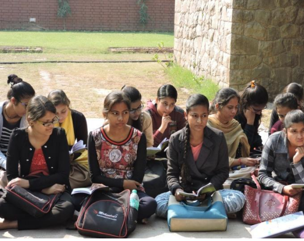
Observance of the Constitution Day