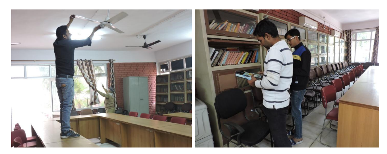
Cleanliness drive in progress

6. Cleanliness Drive: A cleanliness drive was organized on 22 December 2017. Staff and students enthusiastically took part in it. At first, the Library was taken up for cleaning followed by the Director's office.