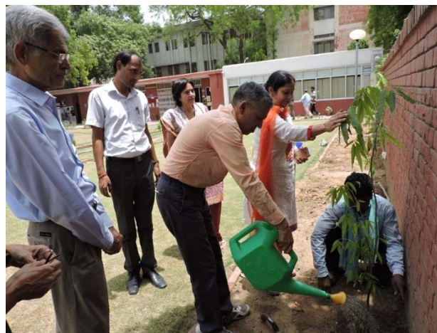
Plantation drive on World Environment Day