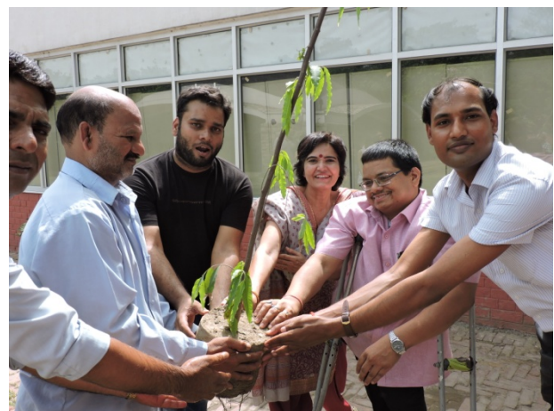
Plantation drive on World Environment Day