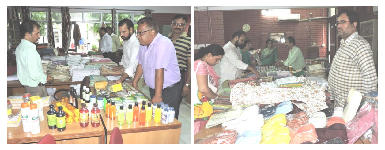
Exhibition-cum-Sale of Khadi products

6. Exhibition-cum-Sale counter of Khadi products: With an aim to promote Khadi and handloom products, an Exhibition-cum-Sale counter of Khadi and handloom products was set-up at Gandhi Bhawan from 8 – 11 August 2017 in collaboration with Khadi Ashram, Kamla Nagar, Delhi. A special discount of 10% was given to the customers.