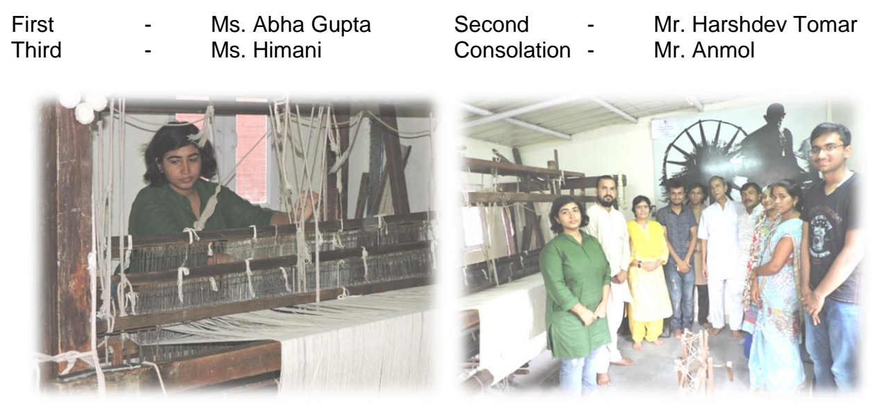
Khaddi Prakshalan Pratiyogita in progress

5. Khaddi prakshalan pratiyogita: A competition on Khaddi prakshalan was organized on 7 August 2017. Students of Khaddi prakshalan certificate course being run at Gandhi Bhawan, took part in the competition. The winners of the competition were: