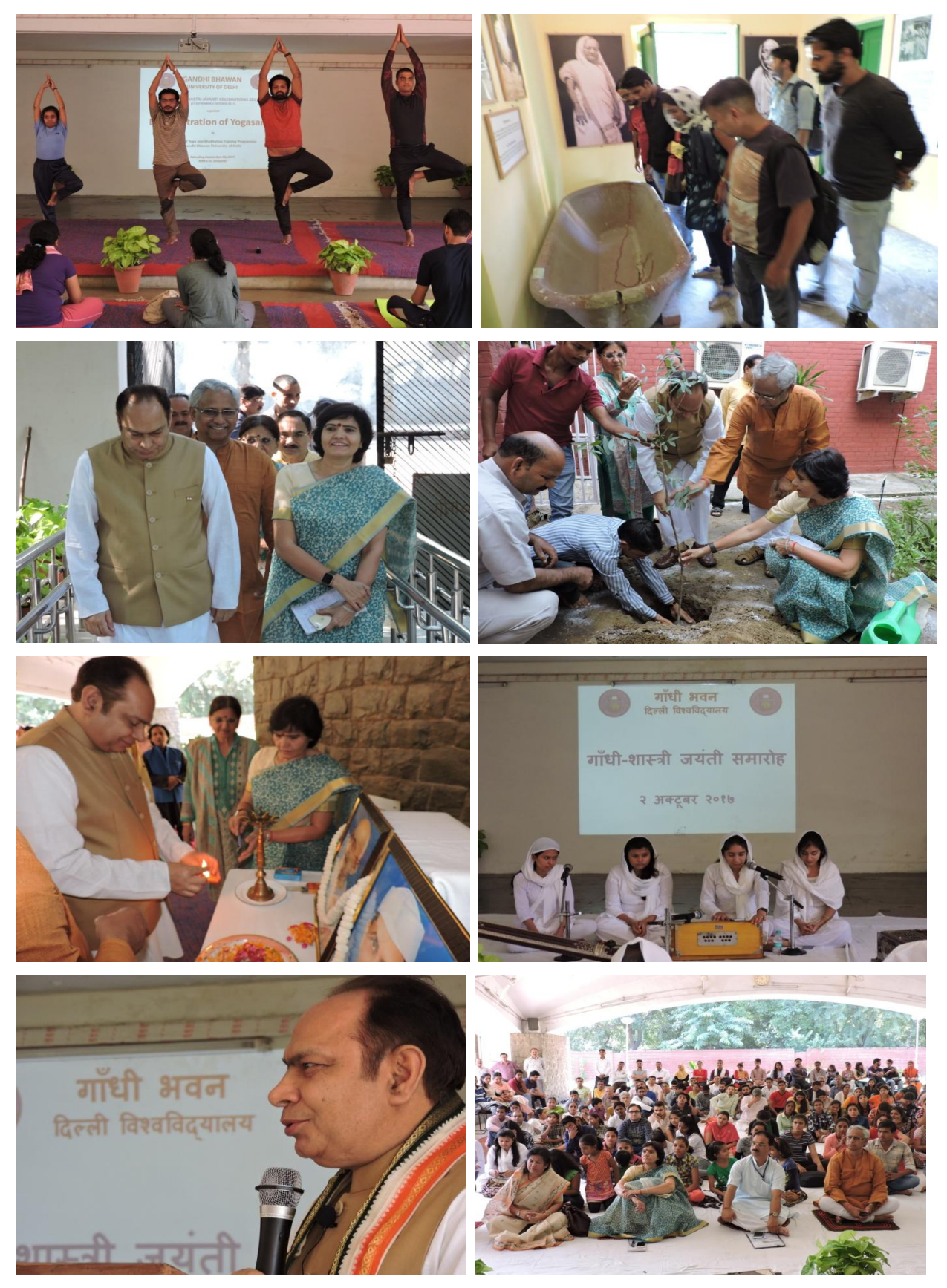
Celebration of Gandhi-Shastri Jayanti: 25 September - 2 October 2017